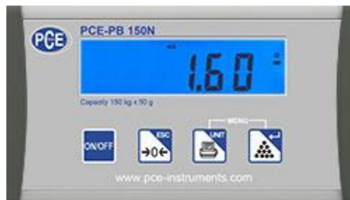
Display of the Platform Scale PCE-PB N Series