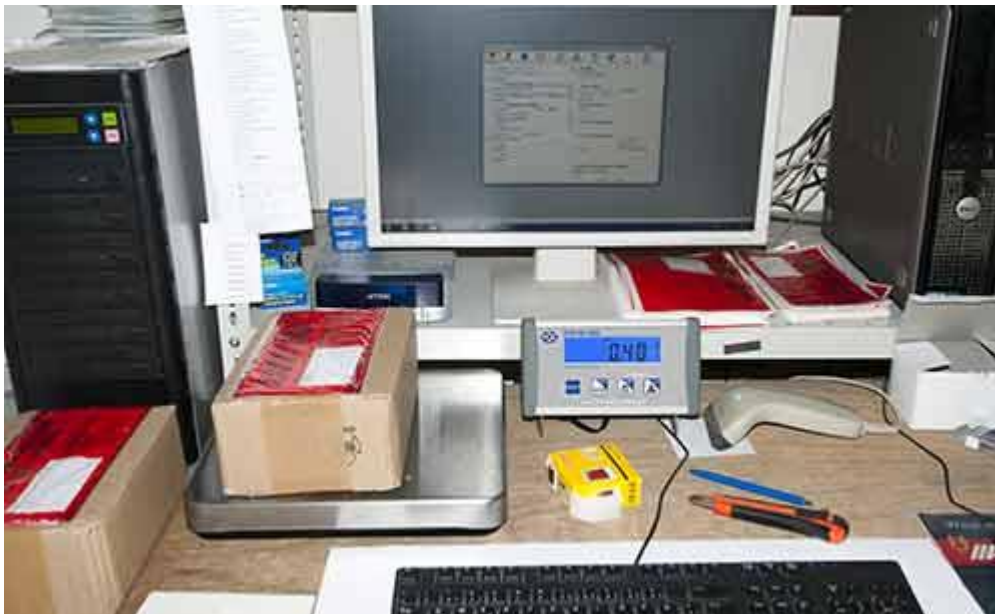
Platform Balance PCE-PB Series in a delivery department.