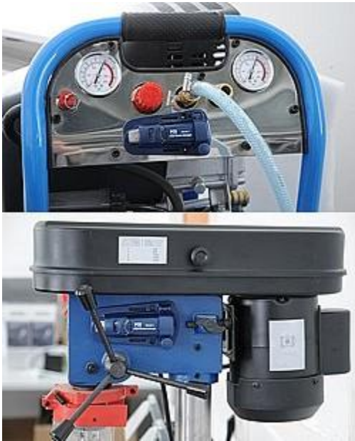
Here you can see the PCE-VD 3 vibration meter being used for the control and analysis of machinery.