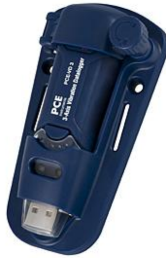
Here you can see the PCE-VD 3 vibration meter with the robust, magnetic and easy wall bracket.